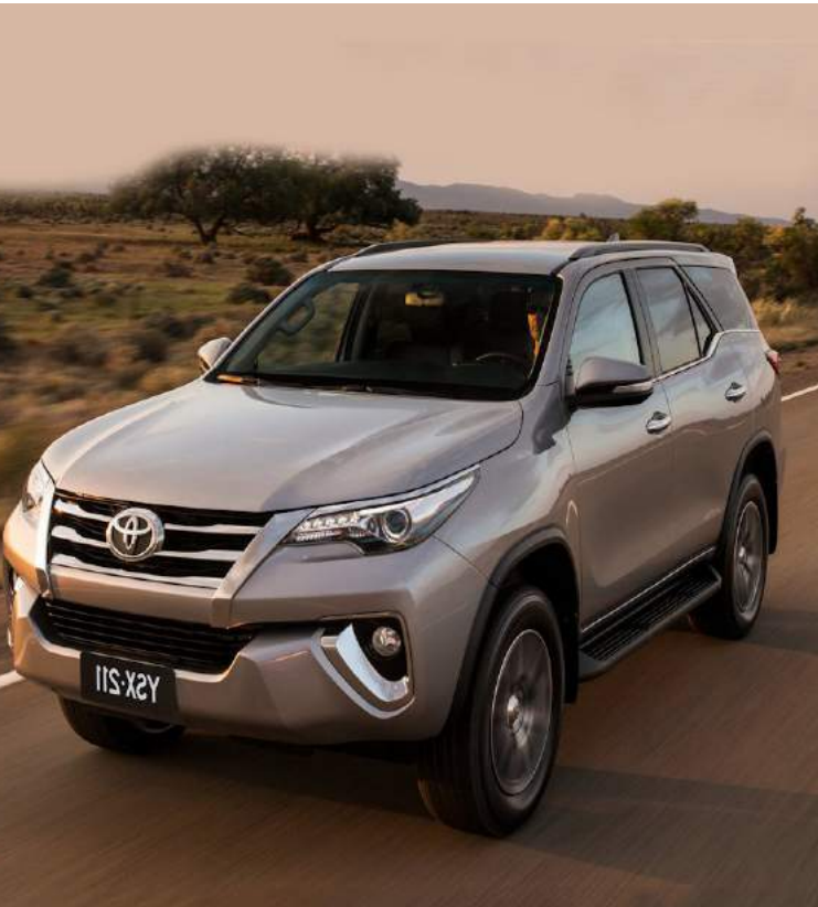
Latest vehicle models.