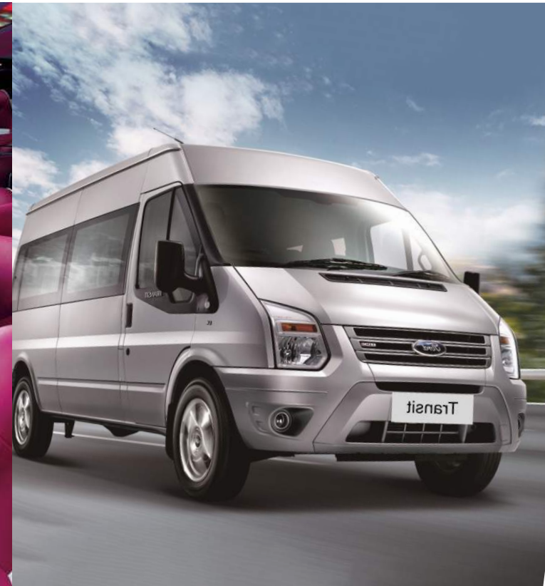
Careful and experienced drivers.