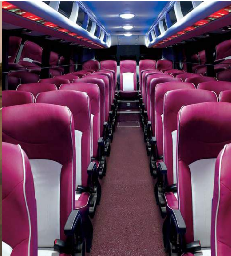
Well-maintained, clean and comfortable.